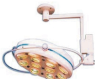
12 Reflectors Ceiling Mounted