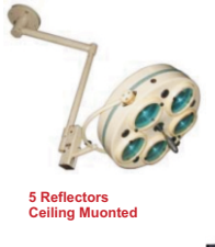
5 Reflectors Ceiling Mounted