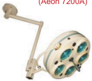
5 Reflectors Ceiling Mounted