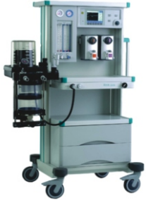
Anaesthesia Machine (Aeon 7200A)