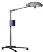
Mobile Theatre Light