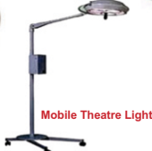
Mobile Theatre Light