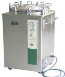
Fully Automatic Autoclave 50 & 70 Litres