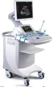
Touch Apogee 3500 Digital Color Doppler Ultrasound Imaging systems Live 3D & 4D Imaging