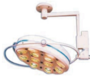
12 Reflectors Ceiling Mounted