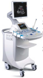
Touch Apogee 3500 Digital Color Doppler Ultrasound Imaging systems

Live 3D & 4D Imaging Unlike complicate operation in traditional live 3D Ultrasound imaging, the apogee 3500 Touch adopts simple and quick operation method. Just with a few simple steps, live 3D Ultrasound images can be easily obtained.