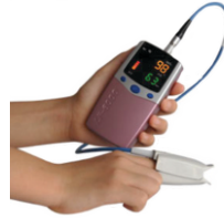
Handheld Pulse Oximeter