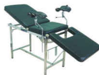
Gynaecological Examination Coach