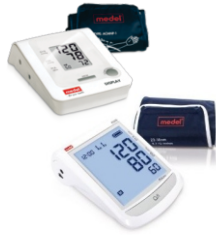
Digital Blood Pressure