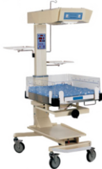
Infant radiant warmer