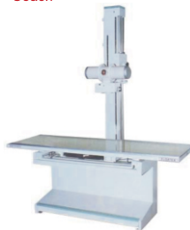
300mA with Chest stand