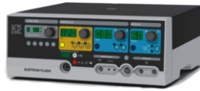
Diathermy GIMA MB 200w