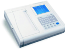
Digital EGG machines 12-channel