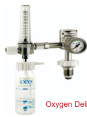
Oxygen Delivery Accessories